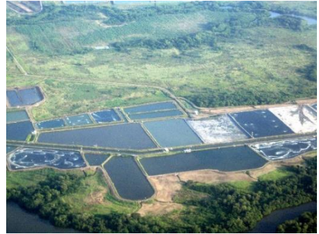
Aerial view of shrimp farm in Guatemala.

Must have a positive impact on the animal health