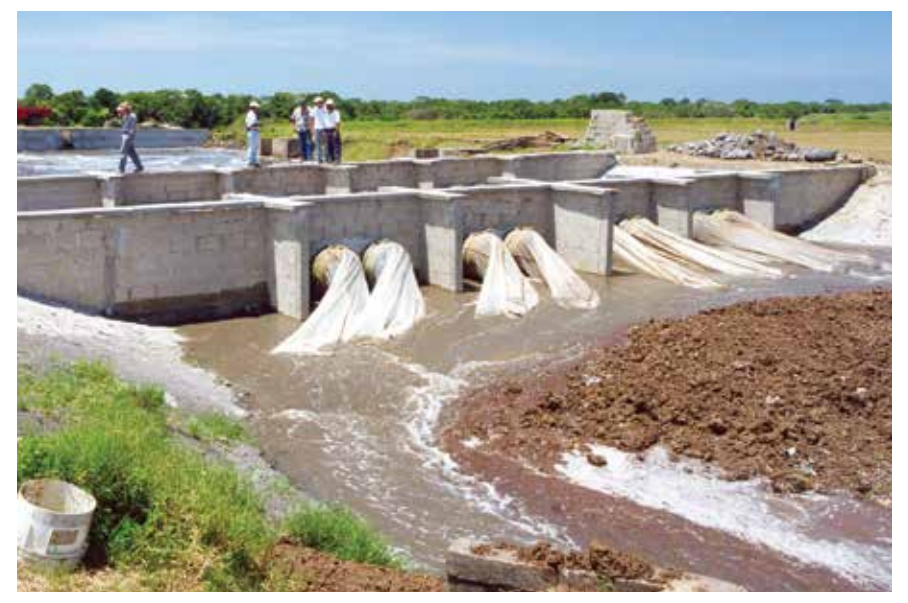
Successful Vibrio control strategies must revolve around limiting inputs, including those that come in with the water. Proper pond preparation is essential, as well.